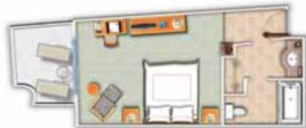
Tower Ocean Front - 350 square feet (86 sq ft lanai)