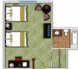
Royal Grove – 324 square feet

Among the resorts 528 rooms and suites are the inimitable Prestige Suites. Offering oceanfront views, spacious dining and living areas and premium services, these rare accommodations elevate hospitality to a completely new echelon.