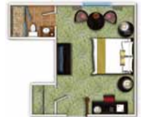
Royal Ocean – 330 square feet