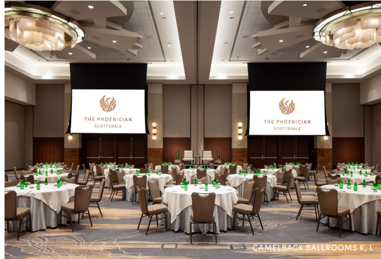
CAMELBACK BALLROOMS K, L