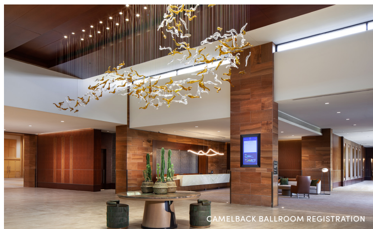
CAMELBACK BALLROOM REGISTRATION