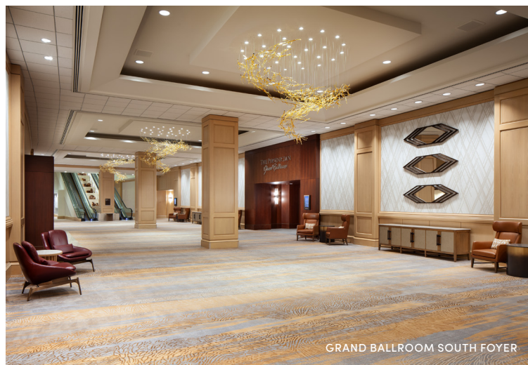
GRAND BALLROOM SOUTH FOYER